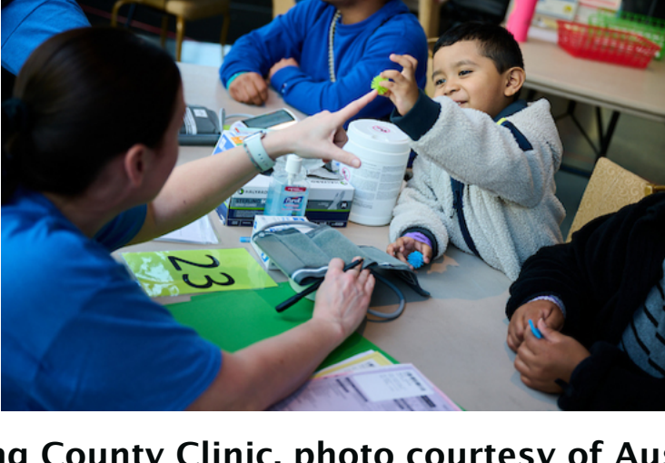
Seattle/King County Clinic