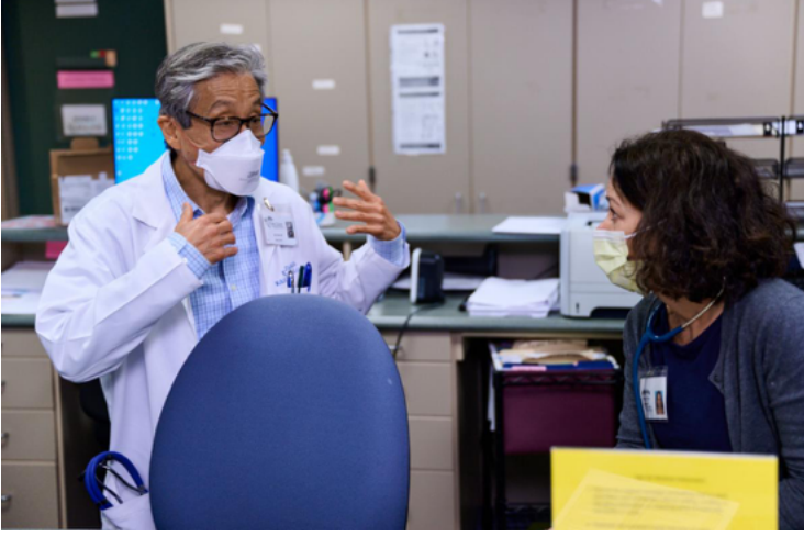
Free Clinic of SW Washington

Advocate Recovery Services, Battle Ground HealthCare, Bayside Housing and Services, CarePoint Clinic, Caring Hands Worldwide, Christ Community Free Clinic, Community Health Partners, Consejo Counseling and Referral, Dungeness Valley Health & Wellness, Free Clinic of SW Washington, Grace Clinic, Health and Hope Free Clinic, Lahai Health, MAPU MAIA, MercyWatch, Neighborhood Clinic, New Heights Clinic, Olympia Union Gospel Mission, Olympic Peninsula Community Clinic, Operation Nightwatch Free Clinic, Pierce County Medical Reserve Corps Clinic, Safe Harbor Free Clinic, Seattle/King County Clinic, SOS Health Services of Walla Walla, The Health Center, The Olympia Free Clinic, Trinity Neighborhood Clinic, Union Gospel Mission Inland Northwest, Upper Valley MEND Free Clinic, UW SOM Service Learning, Yakima Ave Health for All Free Clinic, Yakima Union Gospel Mission Medical Care Center